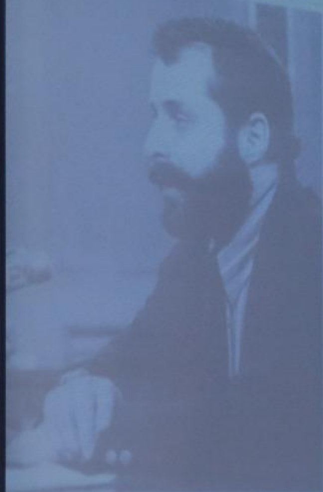
Whistleblower, Peter Buxtun, 1966